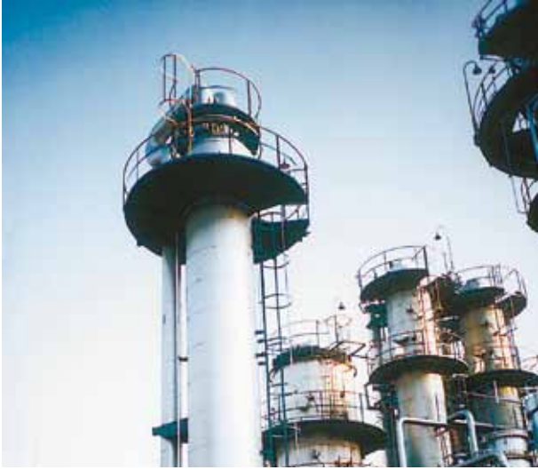
A Packinox refinery installation