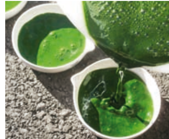
High concentrations of Omega-3 fatty acids are being used in pharmaceutical and health supplement products, as well as many other foods and beverages.

However, the commercialization of algae presents a number of challenges, from processing capacity limitations to costs. To address this problem, Alfa Laval is joining the growing number of players to help them exploit the opportunities in algaculture with its separation, heat exchange and other leading technology solutions.