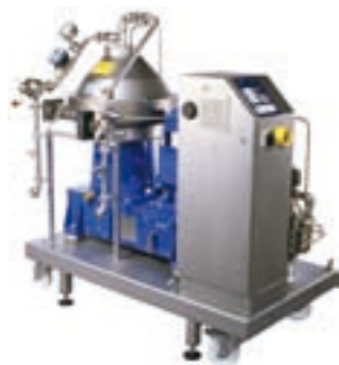
High-speed separator system

A number of Alfa Laval separators are used in the harvesting stage to separate the algae cells from the liquid growth media. These include both intermittent and continuous discharging separators.