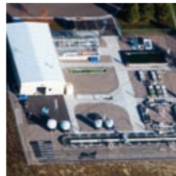
Culturing capacity. The algae raceways and ponds at the Solar BioInnovations Facility have a total capacity of more than 200,000 liters of algae.

About Aurora: Founded in 2006 by three University of California-Berkeley graduates with a vision for developing highly productive algae strains that could be used to generate much needed sustainable products, Aurora Algae is a producer of high-performance algae-based products for use in the pharmaceutical, nutrition, aquaculture, animal feed and fuels market.